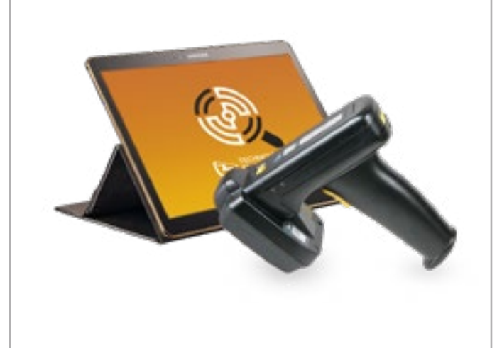
With Samsung Galaxy Tab S